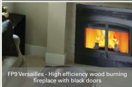
FP9 Versailles - High efficiency wood burning fireplace with black doors