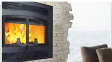
FP9 Versailles - High efficiency wood burning fireplace with black doors