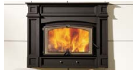
FP8 Saguenay - High efficiency wood burning fireplace with traditional cast iron faceplate and brushed nickel plated door overlay