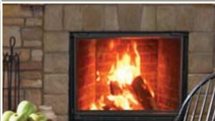
FP7 Antoinette - Decorative wood burning fireplace with guillotine door and masonry trim