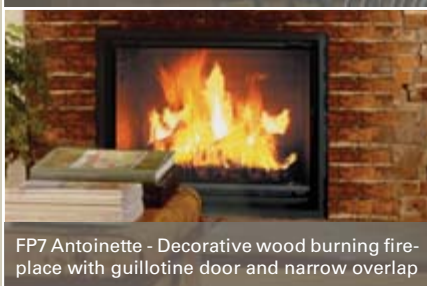
FP7 Antoinette - Decorative wood burning fireplace with guillotine door and narrow overlap