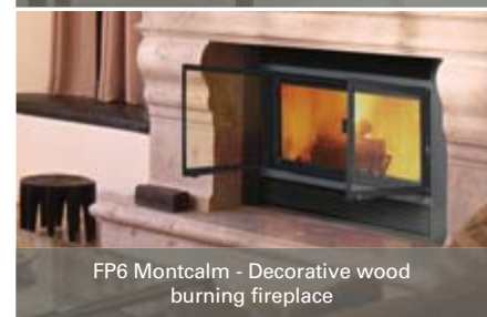
FP6 Montcalm - Decorative wood burning fireplace