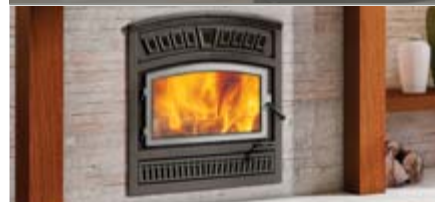
FP10 Lafayette - High efficiency wood burning fireplace with crown style faceplate and brushed nickel plated door overlay