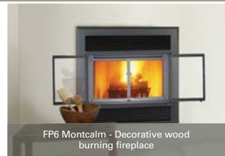
FP6 Montcalm - Decorative wood burning fireplace