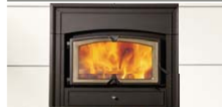
FP8 Saguenay - High efficiency wood burning fireplace with contemporary cast iron faceplate and brushed nickel plated door overlay