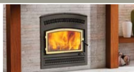
FP10 Lafayette - High efficiency wood burning fireplace with Victoria style faceplate and gold plated door overlay