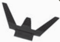
Cast iron andiron

FP8 Saguenay - High efficiency wood burning fireplace with steel faceplate and gold plated door overlay