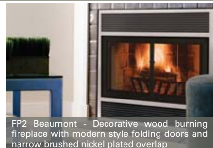
FP2 Beaumont - Decorative wood burning fireplace with modern style folding doors and narrow brushed nickel plated overlap