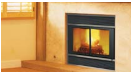
FP1 Manoir - Decorative wood burning fireplace with modern style doors and narrow brushed nickel plated overlap