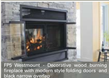
FP5 Westmount - Decorative wood burning fireplace with modern style folding doors and black narrow overlap